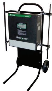
AC6000-CART-00 Two-wheeled Cart Optional for mounting ISB to allow for moving the unit while power is off