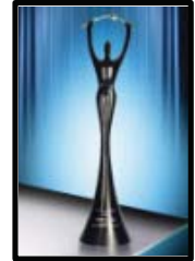
Electra Award 2005