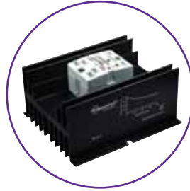
Optional Heat Sink (SSR-HS-1) Section 3 p.20