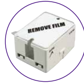
Optional Thermal Pad (SSR-TP-1) Section 3 p.21

We at Magnecraft strive to be your one-stop-shop for all of your solid state relay needs. The new line of 6 series solid-state relays give industrial relay users an energy-efficient current switching alternative. Depending on the application, these solid-state relays offer a number of advantages over electromechanical relays, including longer life cycles, less energy consumption and reduced maintenance costs. This is why great care and attention was given when developing the next generation of "Hockey Puck" style SSRs. These new SSRs will be finger-safe, fit a pre-cut heat transfer thermal pad (sold separately) and have the ability to be mounted onto a factory tested pre-drilled and tapped heat sink (sold separately).