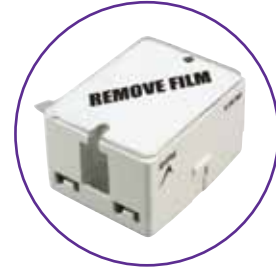
Optional Thermal Pad (SSR-TP-1) Section 3 p.21

We at Magnecraft strive to be your one-stop-shop for all of your solid state relay needs. The new line of 6 series solid-state relays give industrial relay users an energy-efficient current switching alternative. Depending on the application, these solid-state relays offer a number of advantages over electromechanical relays, including longer life cycles, less energy consumption and reduced maintenance costs. This is why great care and attention was given when developing the next generation of "Hockey Puck" style SSRs. These new SSRs will be finger-safe, fit a pre-cut heat transfer thermal pad (sold separately) and have the ability to be mounted onto a factory tested pre-drilled and tapped heat sink (sold separately).