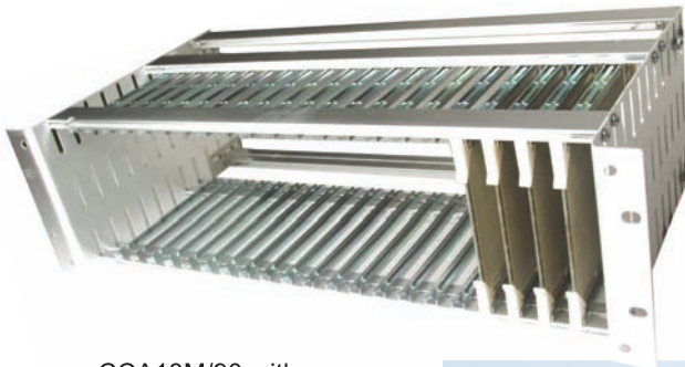
CCA13M/90 with Screw-in guides