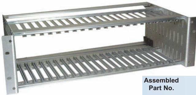
CCA13S/90 - Assembled Subrack with 21 pairs on Snap-in Guides