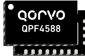
24 Pin 5x3 mm QFN Package

The QPF4588 integrates a 5 GHz power amplifier (PA), regulator, single pole two throw switch (SP2T), bypassable low noise amplifier (LNA) and coupler into a single device