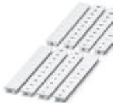
Zack marker strip, Can be ordered: Strip, white, Labeled according to customer specifications, Mounting type: Snap into tall marker groove, For terminal block width: 8.2 mm, Lettering field: 10.5 x 8.15 mm

Marker for terminal blocks - UC-TM 8 CUS - 0824597