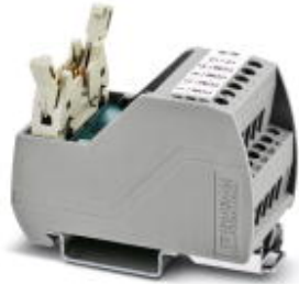
VARIOfACE Professional (VIP) board for the ROC800 controller

Please be informed that the data shown in this PDF Document is generated from our Online Catalog. Please find the complete data in the user's documentation. Our General Terms of Use for Downloads are valid ( http://phoenixcontact.com/download )