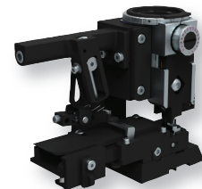
Pacific-Style SF Mechanical