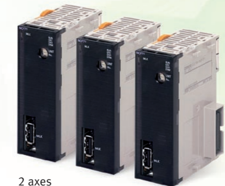
2 axes 4 axes 16 axes