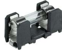
OGN-SMD equipped with fuse

500 VAC · 4 W/16 A (VDE) · 500 V · 16 A (UL/CSA)