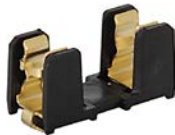
OGN-SMD for increased solder temperature with gold contacts