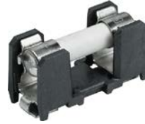
OGN-SMD equipped with fuse