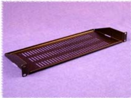
Vented (7" Deep - 1U Shown)

Path: Home > Rack Index > Shelves (Fixed) - Panel Mount