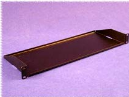
Unvented (7" Deep - 1U Shown)