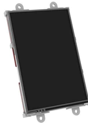
The uLCD-35DT Display Module