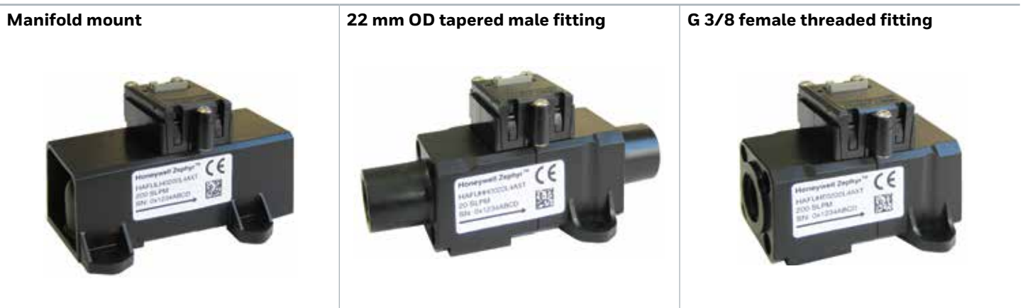
Figure 3. All Available Standard Configurations

1 Apart from the general configuration required, other customer-specific requirements are also possible. Please contact Honeywell.