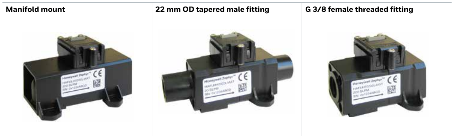
Figure 3. All Available Standard Configurations

1 Apart from the general configuration required, other customer-specific requirements are also possible. Please contact Honeywell.