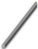
Connection pin, Length: 1000 mm, Color: gray