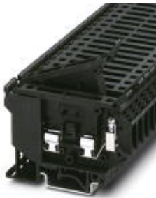
Fuse terminal block for cartridge fuse insert, cross section: 0.2 - 4 mm 2 , AWG: 26 - 10, width: 8.2 mm, color: Gray

Please be informed that the data shown in this PDF Document is generated from our Online Catalog. Please find the complete data in the user's documentation. Our General Terms of Use for Downloads are valid ( http://download.phoenixcontact.com )