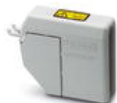
Covering hood, Width: 28.8 mm, Height: 59 mm, Color: gray