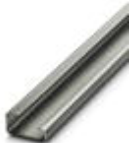
G-profile DIN rail, material: Steel, unperforated, height 15 mm, width 32 mm, length 2 m

DIN rail - NS 32 UNPERF 2000MM - 1201015