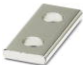
Connection rail, Color: silver