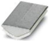
Insertion profile, Color: silver