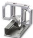
End clamp, for end support of UKH 50 - UKH 240, is pushed onto DIN rail NS 32 and fixed with 2 screws, width: 10 mm, color: Aluminum