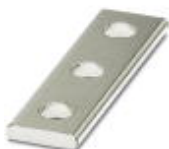
Connection rail, Color: silver