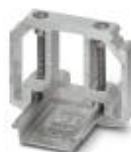
End clamp, for end support of UKH 50 to UKH 240, is pushed onto DIN rail NS 35 and fixed with 2 screws, width: 10 mm, color: aluminum