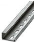
G-profile DIN rail, material: Steel, perforated, height 15 mm, width 32 mm, length 2 m

DIN rail - NS 32 UNPERF 2000MM - 1201015