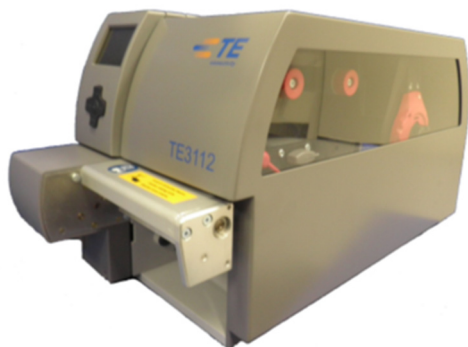
TE3112 fitted with, metal cover and Cutter/perforator