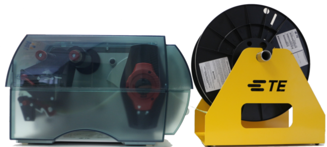
TE3112 with Universal reel holder