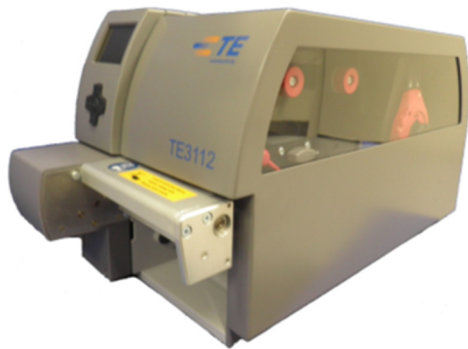
TE3112 fitted with, metal cover and Cutter/perforator