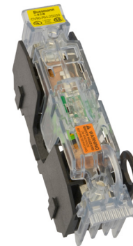
Table 4. Class R fuse block catalog numbers