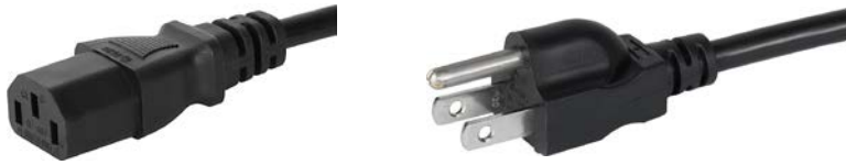
Power plug Japan black