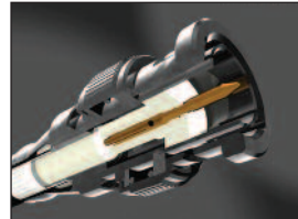
2. Pin is Pushed Through