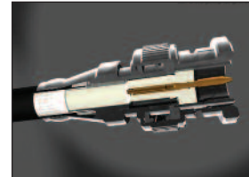
3. Pin Becomes Clearly Visible