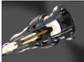
1. Cable Enters Connector

Belden offers the ability to see the cable enter the connector, and for BNC and RCA connectors, a unique pop-up pin confirms a proper termination and contact point. Being able to visually confirm the cable termination means better and faster installation.