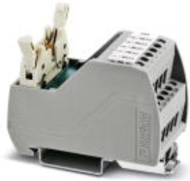
VARIOfACE Professional (VIP) board for the ROC800 controller

Please be informed that the data shown in this PDF Document is generated from our Online Catalog. Please find the complete data in the user's documentation. Our General Terms of Use for Downloads are valid ( http://phoenixcontact.com/download )