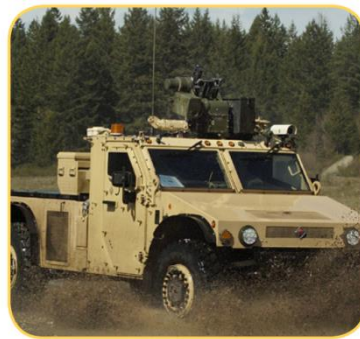
Unmanned Vehicle Control

The VG440 combines highly-reliable MEMS gyros and accelerometers with high-speed DSP electronics to provide a fully stabilized vertical gyroscope in a small and rugged environmentally-sealed enclosure. The VG440 provides consistent performance in challenging operating environments and is user-configurable for a wide variety of applications