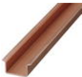
DIN rail, material: Copper, unperforated, 1.5 mm thick, height 15 mm, width 35 mm, length: 2 m

DIN rail - NS 35/15 CU UNPERF 2000MM - 1201895