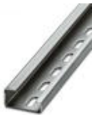
G-profile DIN rail, material: Steel, perforated, height 15 mm, width 32 mm, length 2 m

DIN rail - NS 35/15 CU UNPERF 2000MM - 1201895