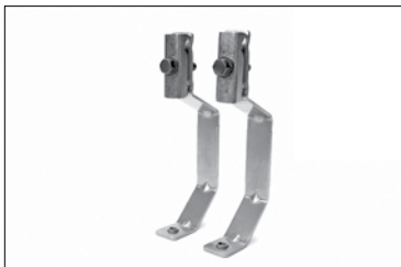
3M™ Offset Hanger Bracket AC-HB4