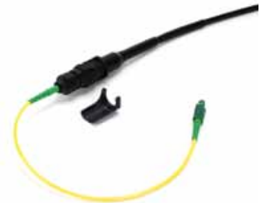
3M™ External Cable Assembly Module (ECAM) FD Factory-Terminated Fiber Drop