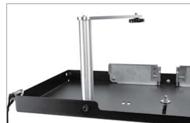
3M™ SLiC™ Fiber Splicing Workstation Cleaver Arm