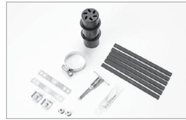
3M™ SLiC™ 6-port Grommets