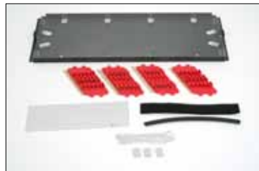
3M™ Fiber Optic Splice Tray 2527

3M, SLiC and Scotchlok are trademarks of 3M Company.