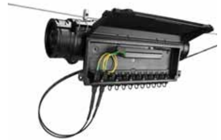
3M™ SLiC™ Fiber Aerial Terminal Closure 530 with Internal Drop Termination for Factory-Terminated ECAM FD Drop Cable

The SLiC 530 is Rural Utilities Services (RUS) Listed.