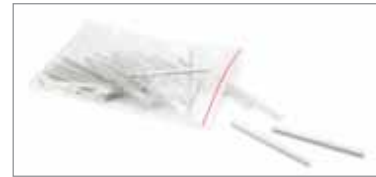
3M™ Fiber Optic Splice Sleeve 2170