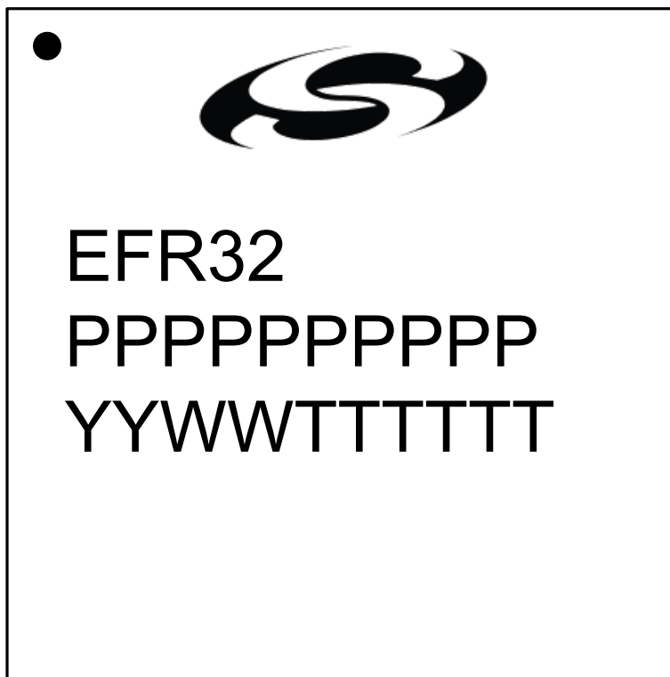
Figure 9.3. QFN68 Package Marking