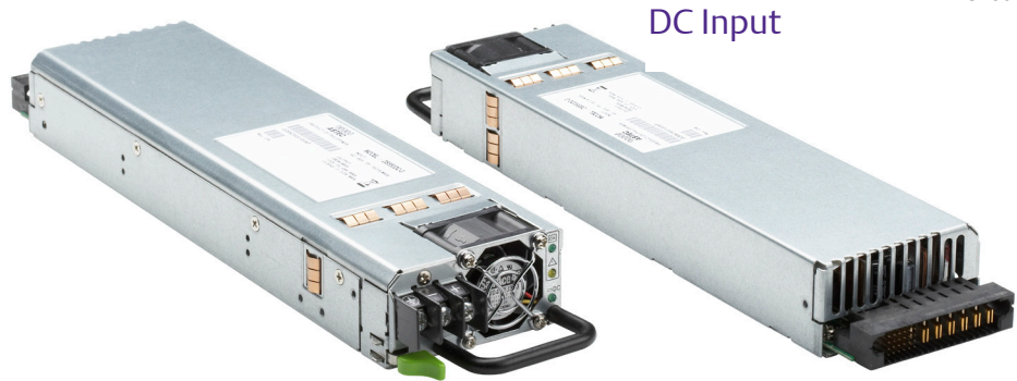
Connector input shown

Distributed Power Bulk Front-End Total Output Power: 450 - 550 Watts +12 Vdc main Output +3.3 Vdc Stand-by Output DC Input 36 - 75 Vdc